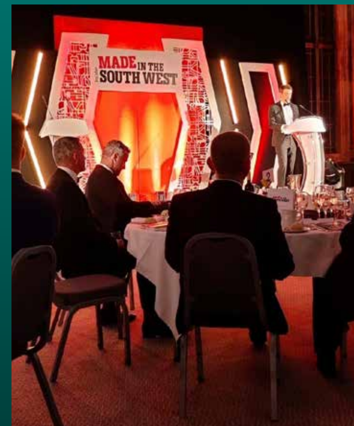
The South West awards. Prolectric are shortlisted for three awards tonight - Manufacturing Innovation, Sustainable Contribution, and Manufacturer of the Year!

In late 2022, we received an Award for Innovation and Technology from AMPS (The Association of Manufacturers of Power Systems). Our Solar Hybrid generator, the ProPower, was singled out for its innovative use of solar, battery and hybrid technology in a single, trailer-mounted unit. We've also received among other awards and recognitions, a Green Apple Award for Environmental Carbon Reduction in 2019.