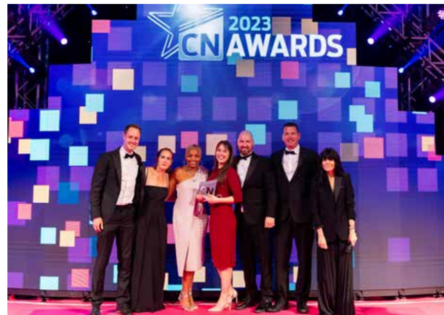
Prolectric won the Carbon Reduction Champions award at the 2023 Construction News Awards.

Prolectric's forward-looking approach to environmental sustainability and social and community engagement demonstrates our dedication to making a positive impact on people and planet while actively involving employees in meaningful CSR initiatives.